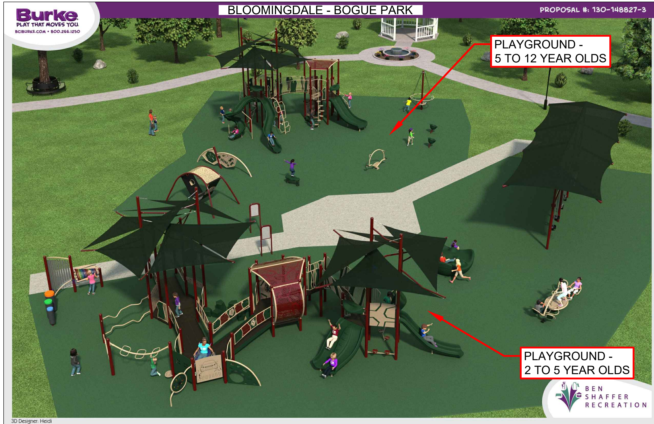
PLAYGROUND RENDERING (NTS)