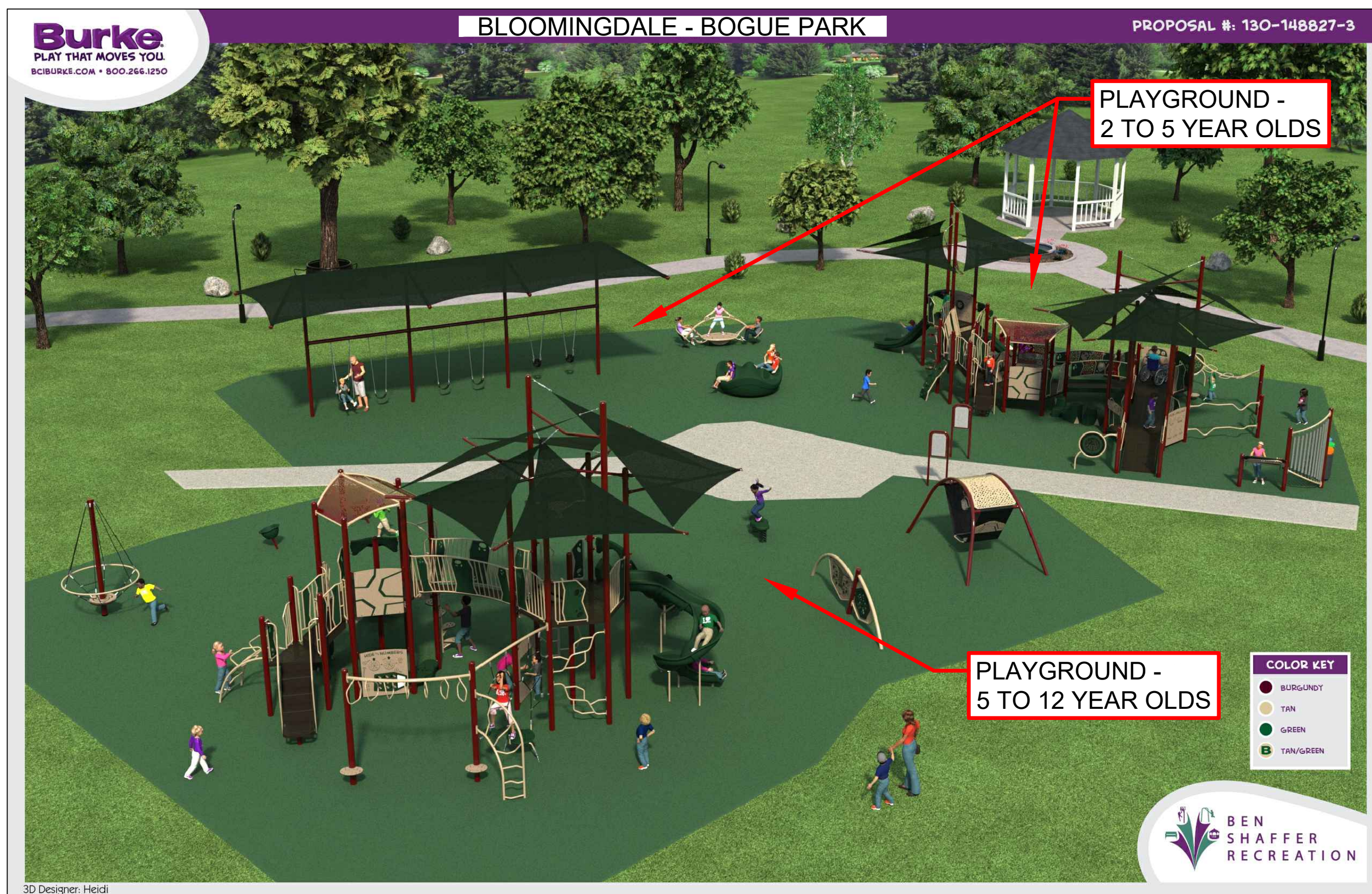
PLAYGROUND RENDERING (NTS)