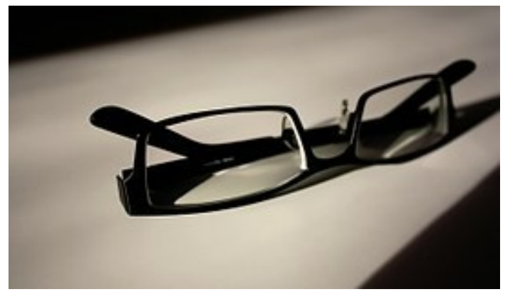
(For those who cannot afford these exams or who do not have health insurance or are under-insured)