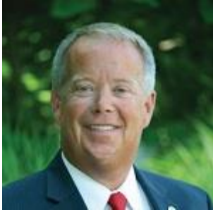
Jonathan Dunleavy Mayor